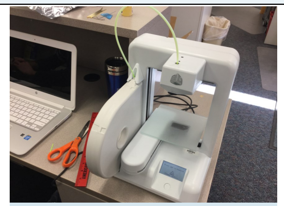
Out and About: Prepping the first print on our Cube 3D Printers!